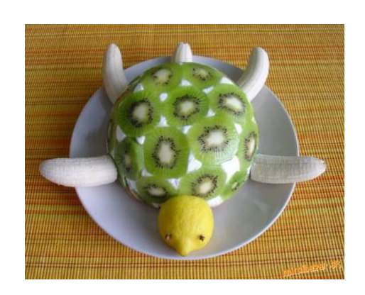
TOO BEAUTIFUL TO EAT!