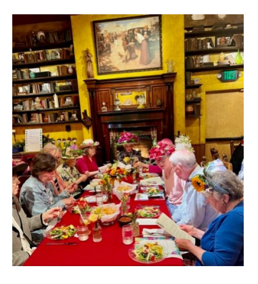
A view of the Original Red Onion banquet room